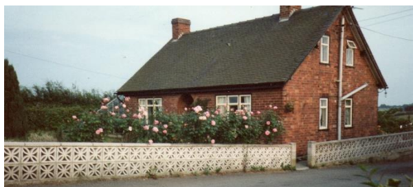
The Firs, Yeaveley